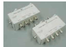
9268 DC BIAS VOLTAGE UNIT Maximum applied voltage: \pm 40 V DC 9269 DC BIAS CURRENT UNIT Maximum applied current: \pm 2 A DC