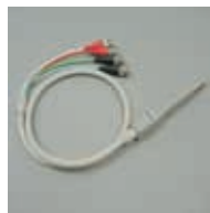
9143 PINCHER PROBE DC to 5 MHz