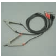
9140 FOUR-TERMINAL PROBE DC to 100 kHz