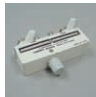
9262 TEST FIXTURE DC to 5 MHz