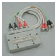
9261 TEST FIXTURE DC to 5 MHz