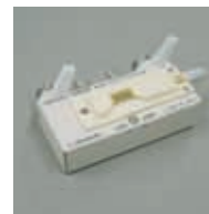
9263 SMD TEST FIXTURE DC to 5 MHz