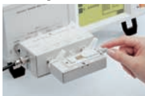
Example of connecting the 9262 and 9268 / 9269

The 9268 can be used for voltages up to a maximum of DC \pm 40 V. The 9269 can be used for currents up to a maximum of DC \pm 2 A.