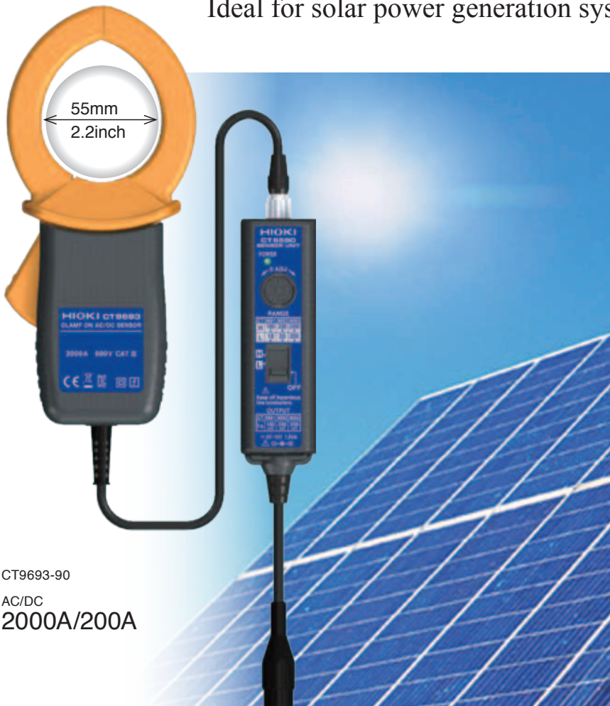
CT9693-90 AC/DC 2000A/200A

Ideal for solar power generation systems, UPS and battery testing