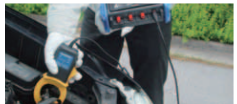
Pair with MEMORY HiCORDERs or oscilloscopes to capture the peak waveforms of current from motor and vehicle starts